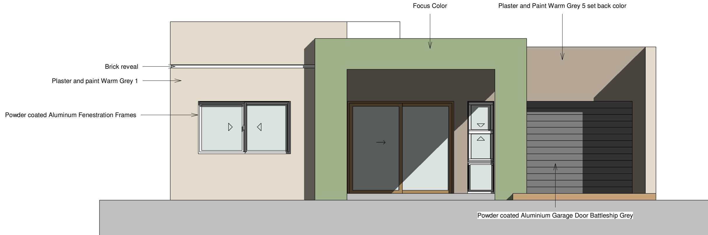
1 Typical Elevation 1 : 50